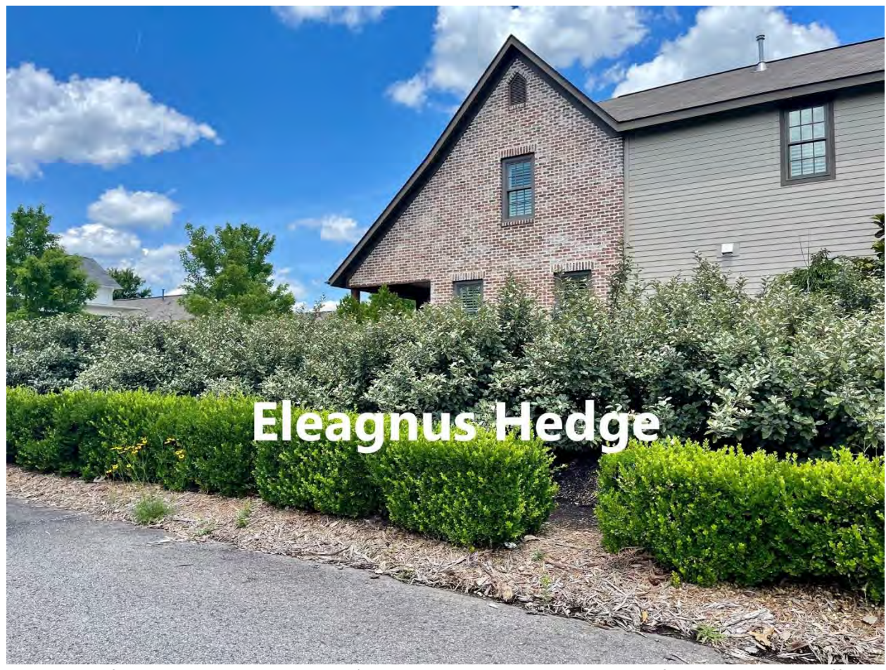
Hedge view from parking lot toward Chris' house – we will install same kind of hedge on North buffer.