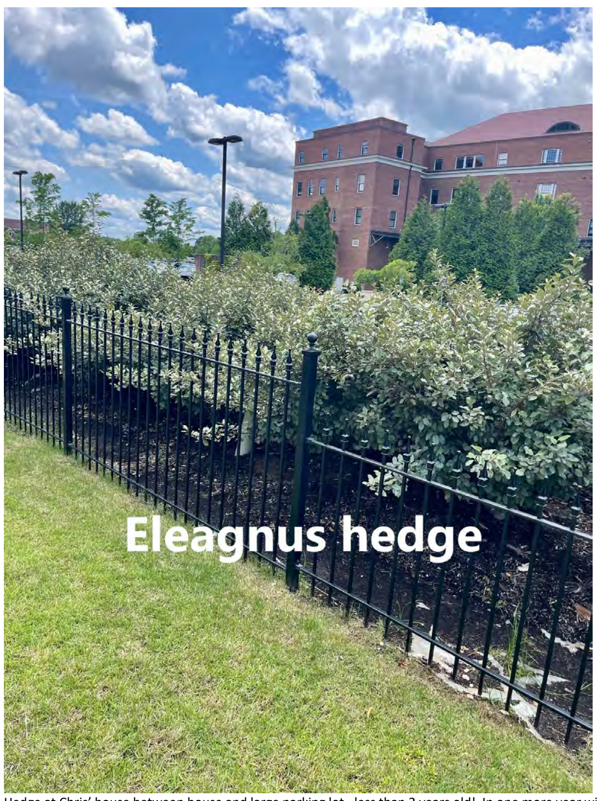
Hedge at Chris' house between house and large parking lot...less than 2 years old! In one more year will be 8' tall!