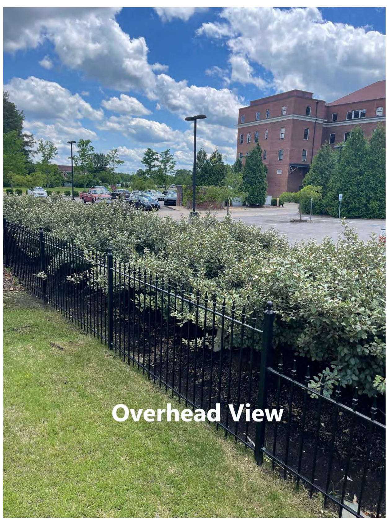
Photo from an 8' high vantage point to show what is already screened on "new" hedges