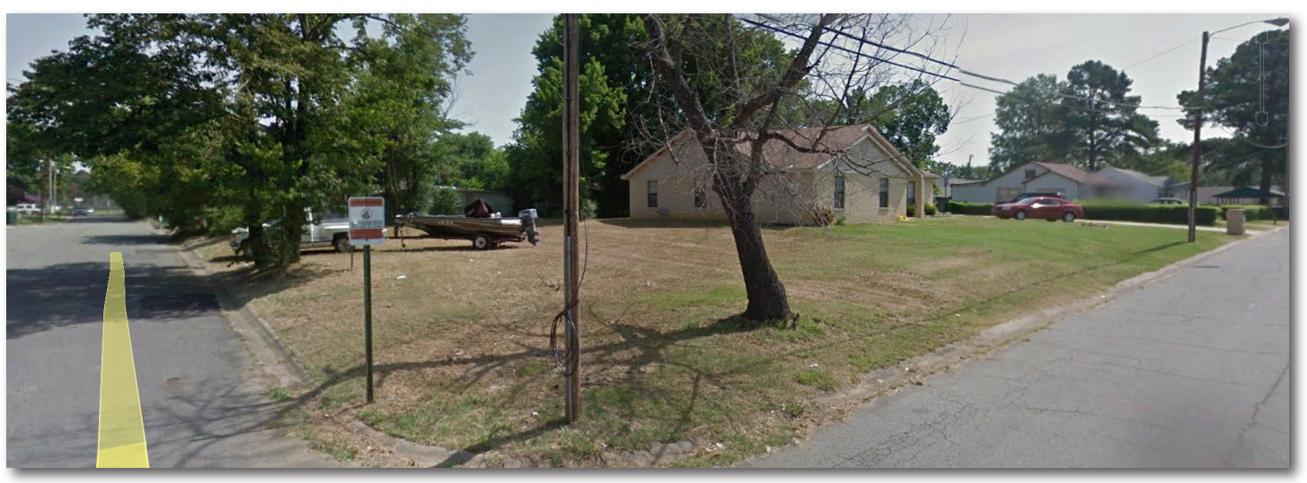
View of 716 Pine Street looking NE