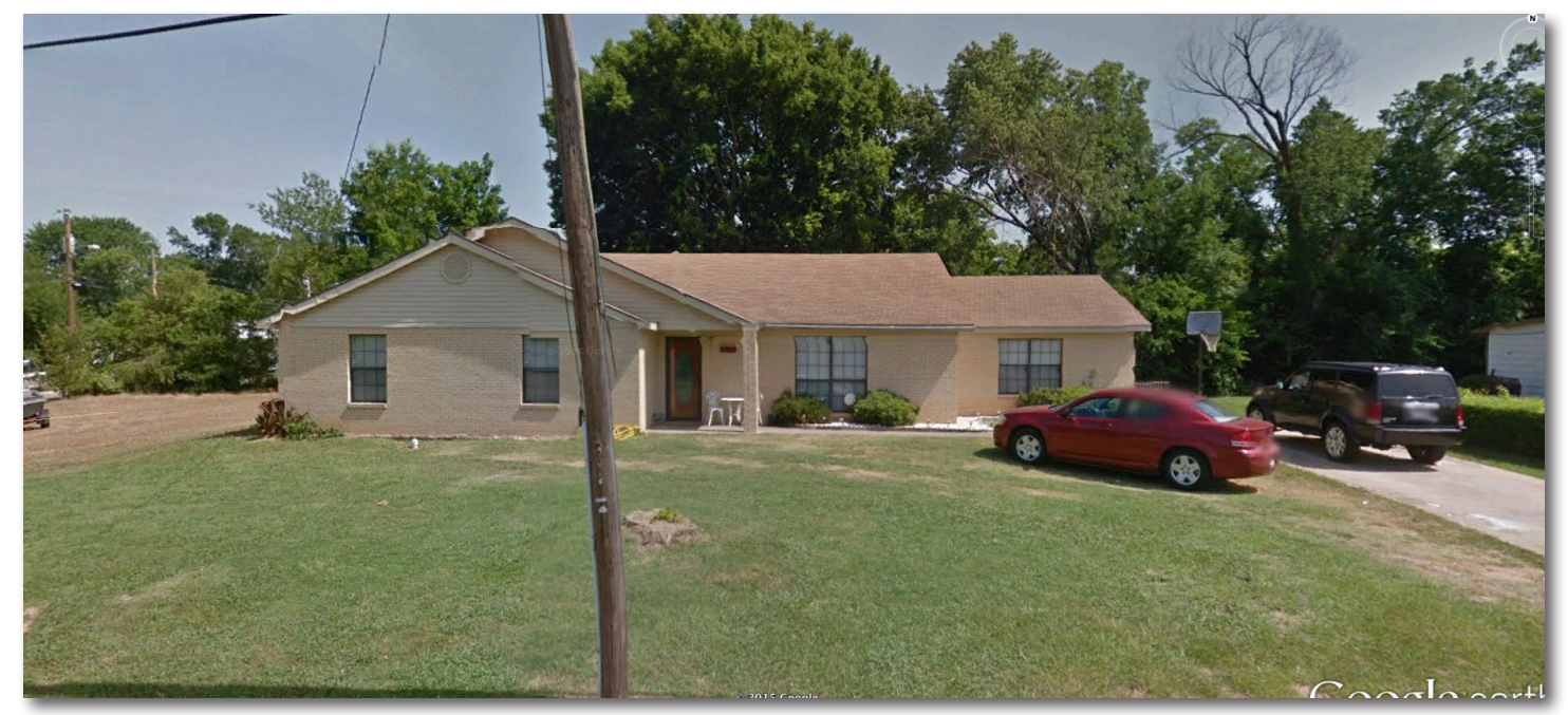
View abutting lot to the E