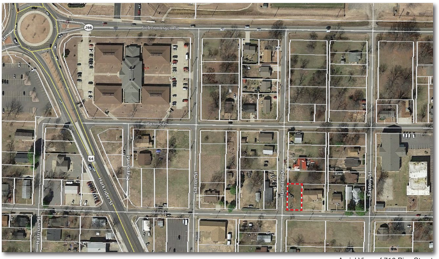
Aerial View of 716 Pine Street