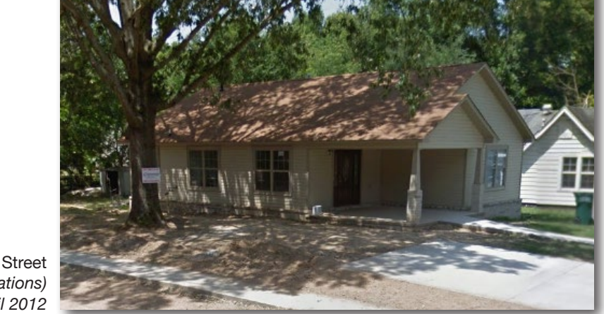
503 Monroe Street Identical home design (incl. modifications) approved in April 2012