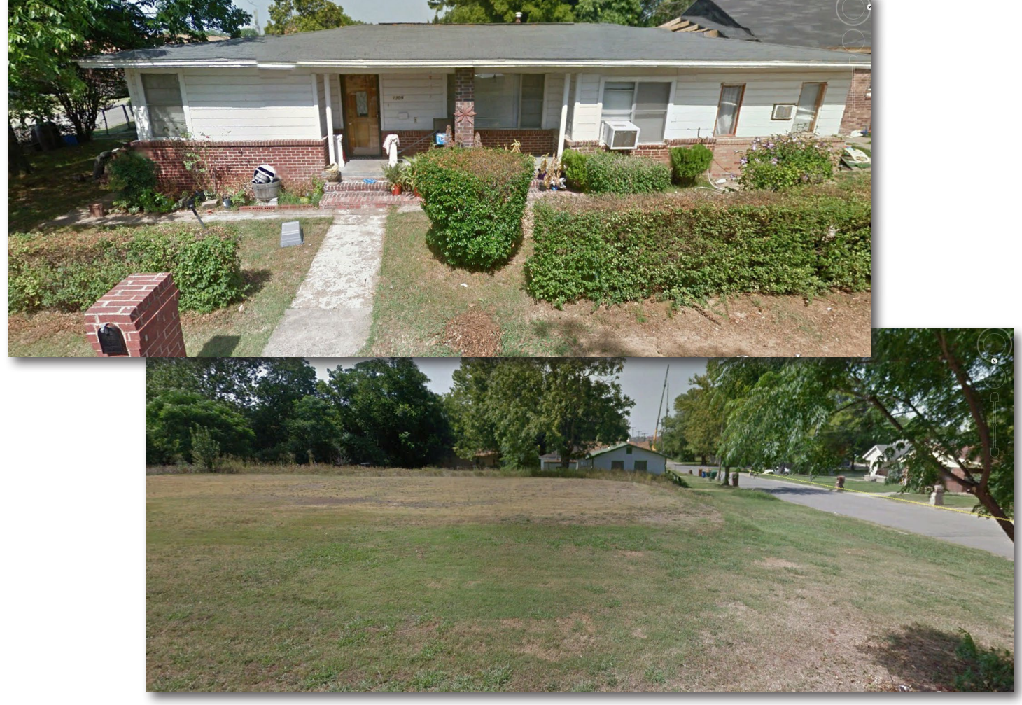
View from property looking S