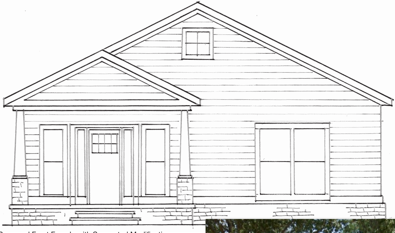
Proposed Front Façade with Suggested Modifications