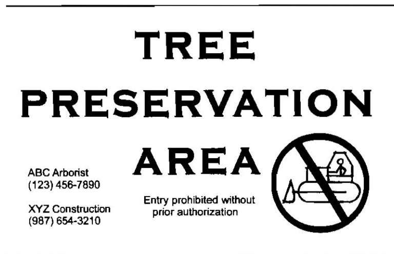
Figure 1. Example of TPZ signage